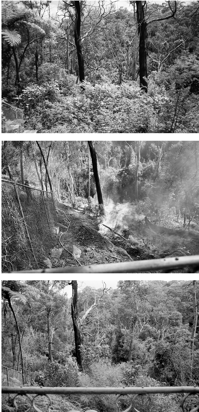
Figure 4. Top: prior to treatment in 1986, Lantana reached into the canopy (photo: N. Pallin). Middle: same view during phase 2 (1993) shortly after weed removal and during the burning of fire piles [note, second tree has fallen; (photo: M. Schofield)]. Bottom: native understory regeneration in 1997, 4 years after treatment (photo: N. Pallin).

Williams, unpubl. data, 1989). With the change in the vegetation during the primary stage of bush regeneration, there was a danger that feral birds, such as the Common Mynah ( Acridotheres tristis ) might invade. Fortunately, this has not occurred.