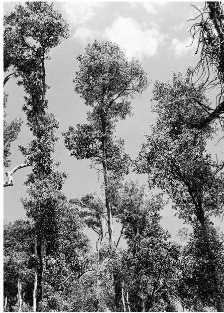
Figure 3. Left: damaged Turpentine canopy in 1985, Ku-ring-gai Flying-fox Reserve, Gordon. Right: recovering Turpentine canopy in 1995, same location.