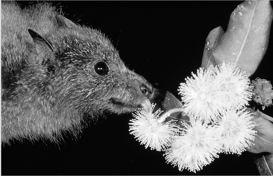
A Grey-headed Flying-fox licking nectar and pollen from a Turpentine flower.