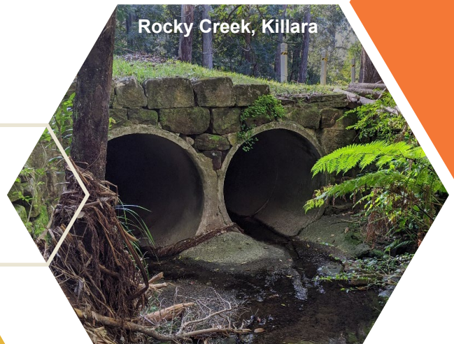
Rocky Creek, Killara