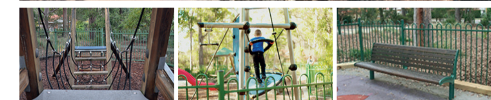
- EXISTING PLAYGROUND