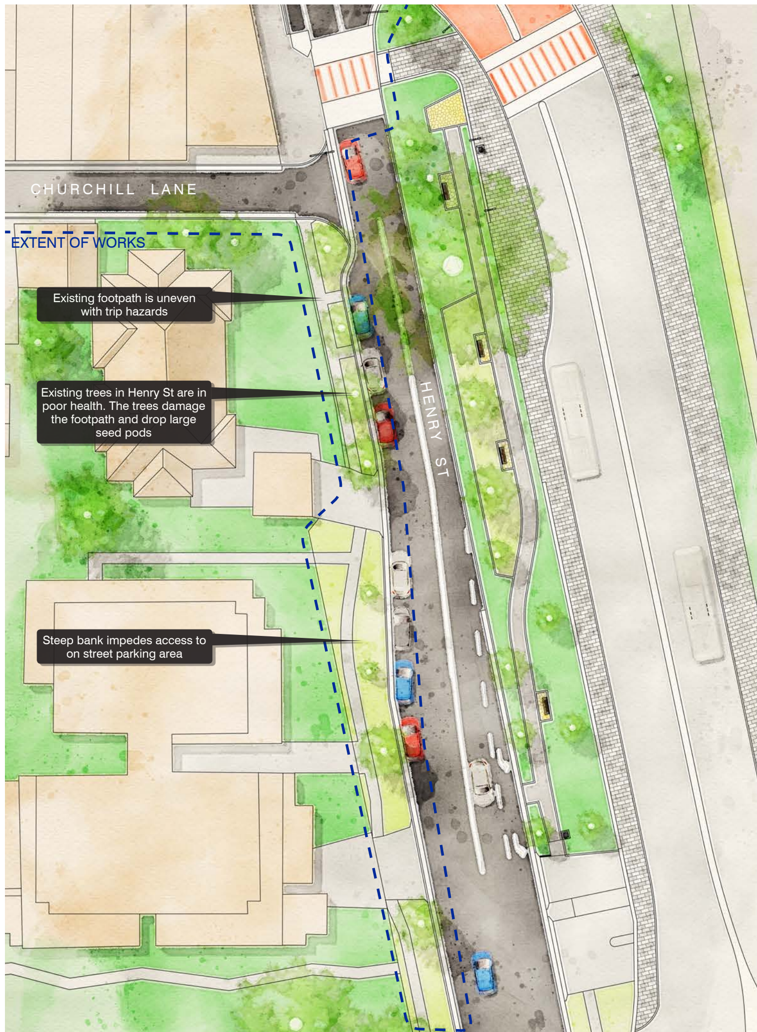
HENRY STREET, GORDON - EXISTING CONDITIONS