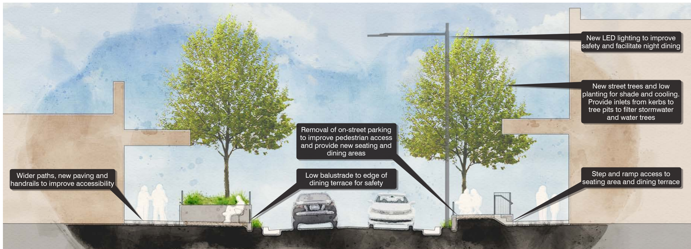
ST JOHNS AVENUE, GORDON - PROPOSED CROSS-SECTION