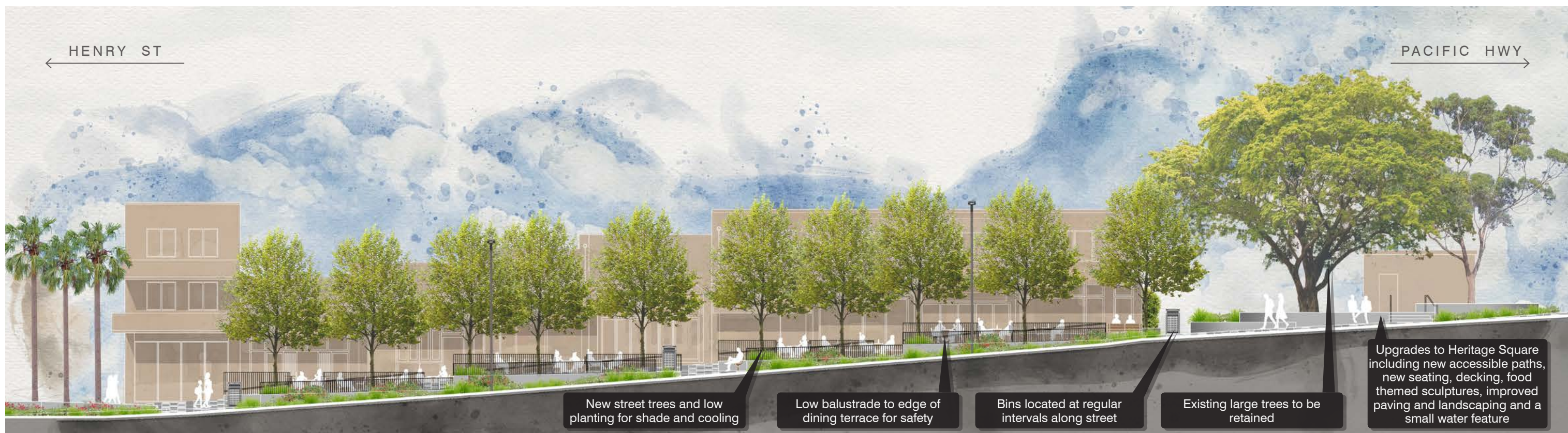
ST JOHNS AVENUE, GORDON - PROPOSED ELEVATION (LOOKING SOUTH)