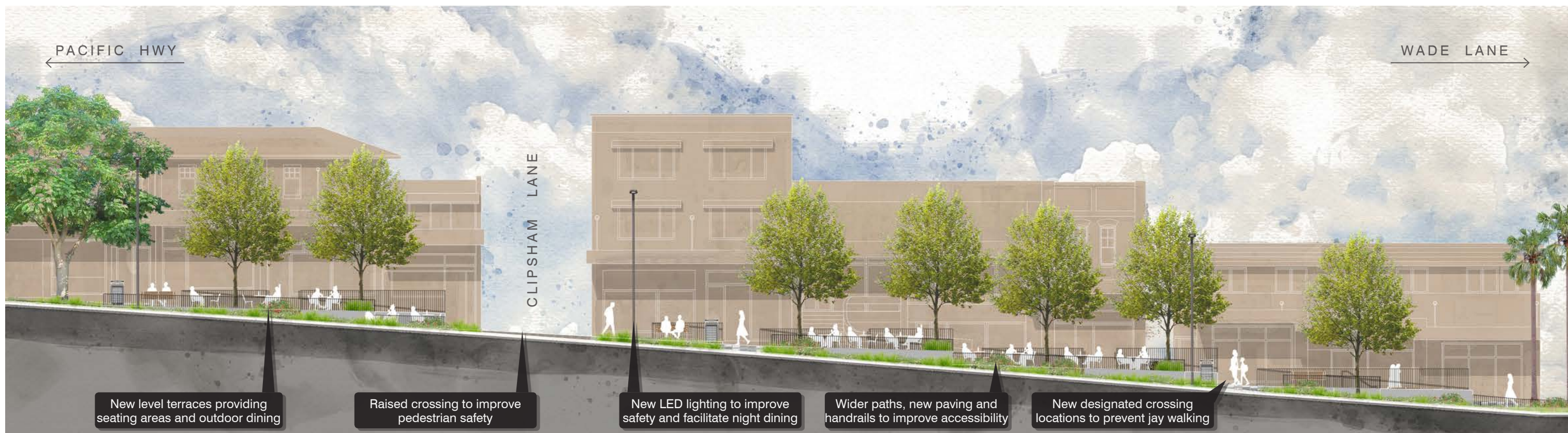
ST JOHNS AVENUE, GORDON - PROPOSED ELEVATION (LOOKING NORTH)