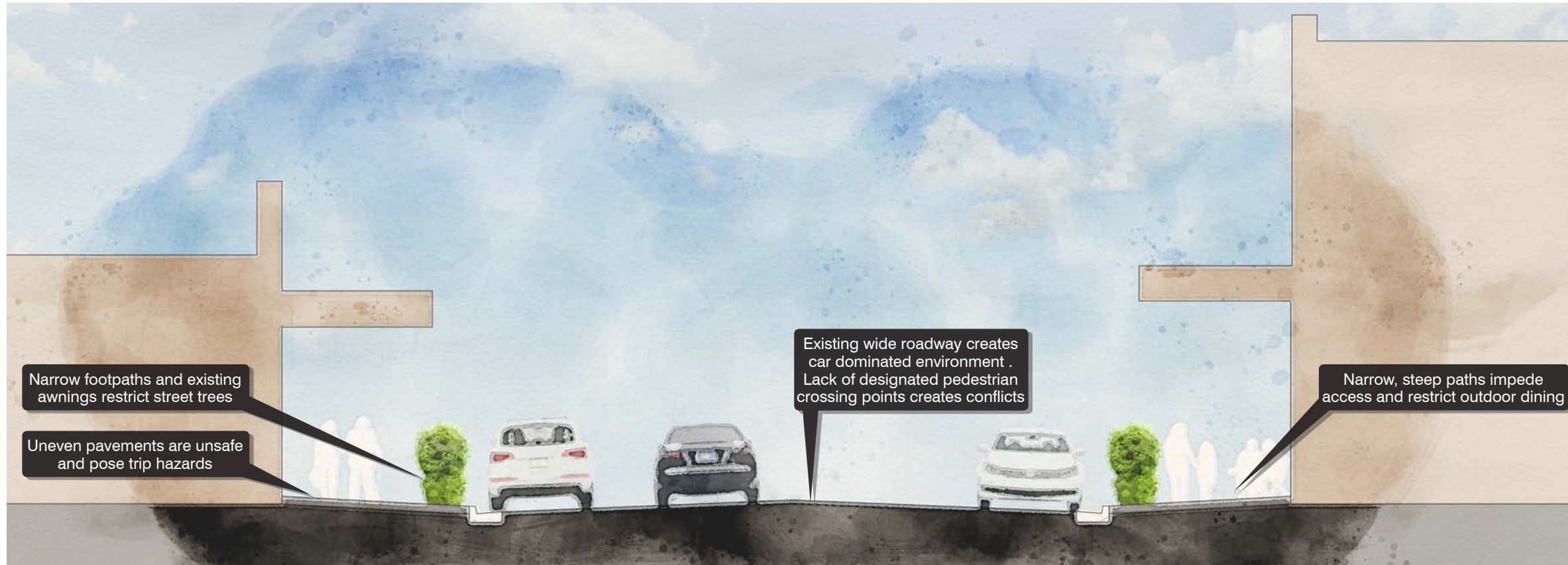
ST JOHNS AVENUE, GORDON - EXISTING CROSS-SECTION