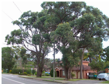
Figure 18.6-1: Examples of Canopy Remnant