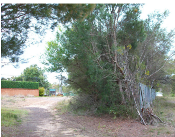
Figure 18.5-1: Examples of Biodiversity Corridors and Buffer Areas