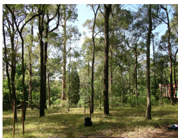
Figure 18.2-1: Examples of Core Biodiversity Lands