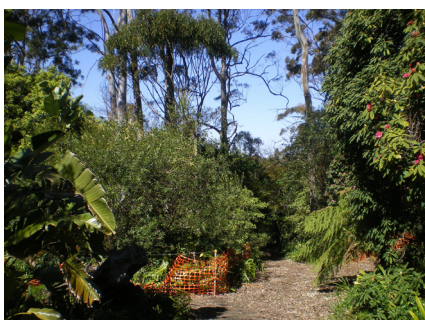
Figure 18.3-1: Examples of Support for Core Biodiversity Lands