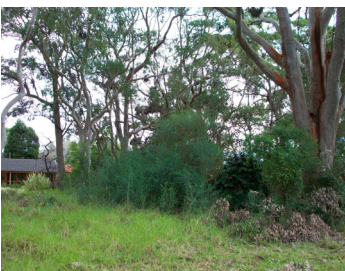
Figure 18.4-1: Examples of Landscape Remnants