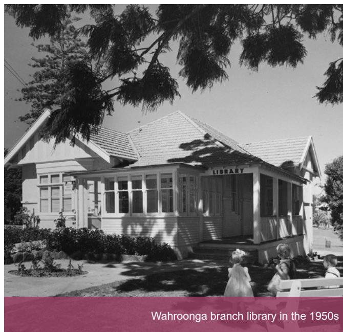
Wahroonga branch library in the 1950s

The library hosted an online class for adults in December on creating Christmas decorations and other festive gifts using beading, plus a Christmas craft session over Facebook for children aged 4-8 years.