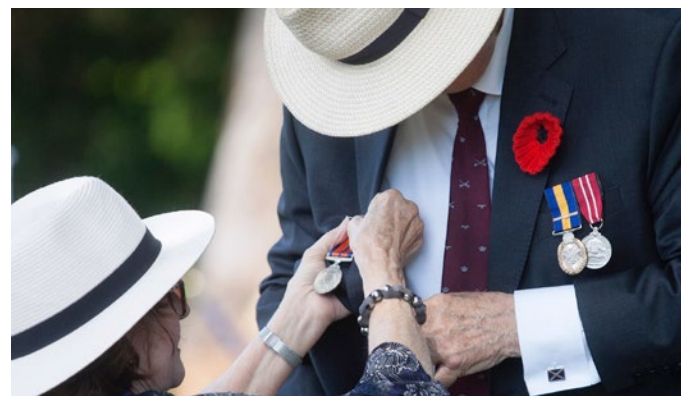
Remembrance Day Ceremony at Roseville

On Friday 20 and Saturday 21 November St Ives Showground hosted a COVID-safe festival of food and entertainment. Organisers coordinated unlimited rides for children, market stalls, food trucks, a gourmet dessert section and live music between 4pm and 10pm.