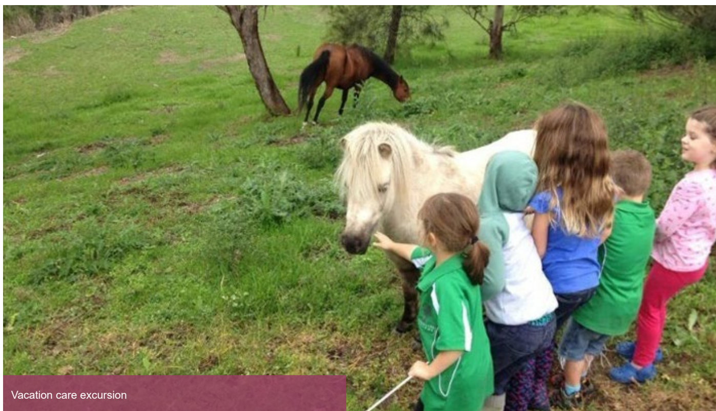
Vacation care excursion

A healthy, safe, and diverse community that respects our history and celebrates our differences in a vibrant culture of learning