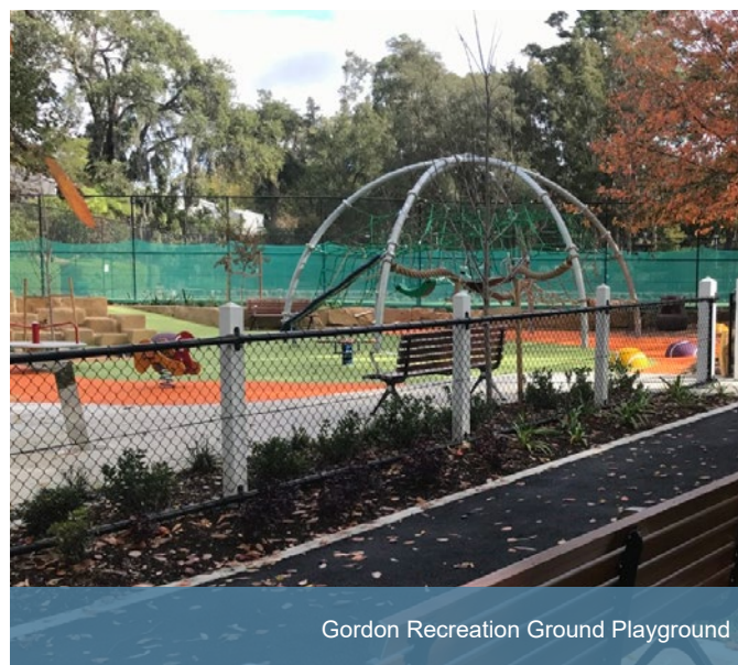
Gordon Recreation Ground Playground

Work was completed on an upgrade to the playground at Putarri Reserve in St Ives. In addition to a new playground, outdoor exercise equipment and animal sculptures were also installed at the reserve.