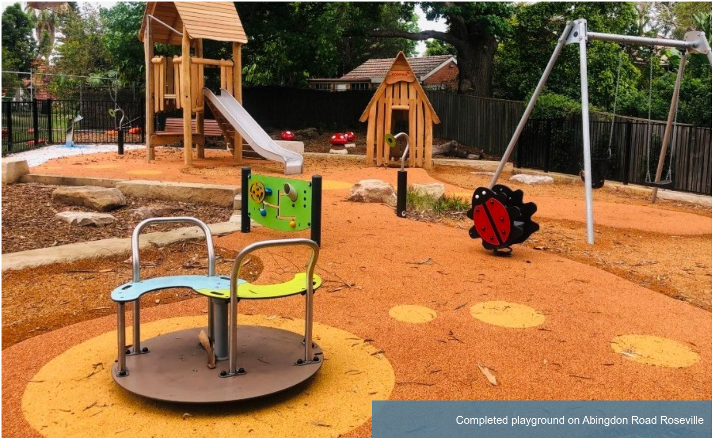
Completed playground on Abingdon Road Roseville

A range of well planned, clean and safe neighbourhoods and public spaces designed with a strong sense of identity and place.