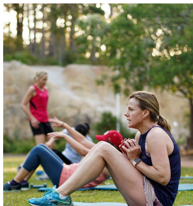
Active Ku-ring-gai programs for all fitness levels

The new single storey tennis pavilion at Roseville Park opened for bookings at the end of November. The new building has change rooms, accessible toilets, a kitchenette, office and storage space and an outdoor sheltered forecourt.