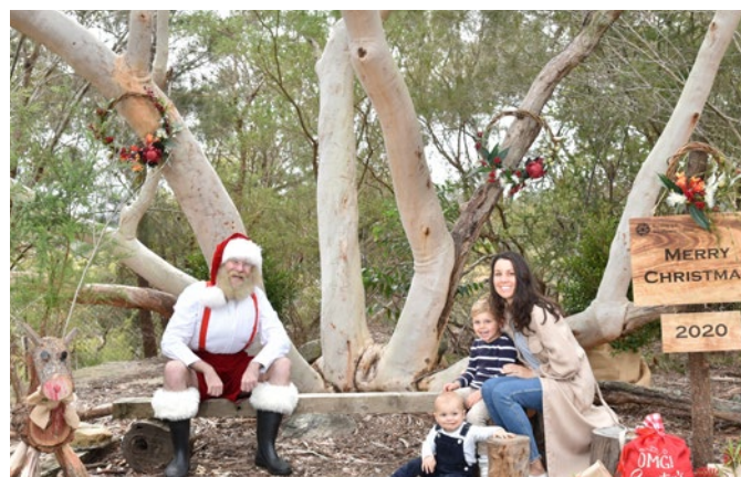
Christmas Celebrations included Santa at the Garden event