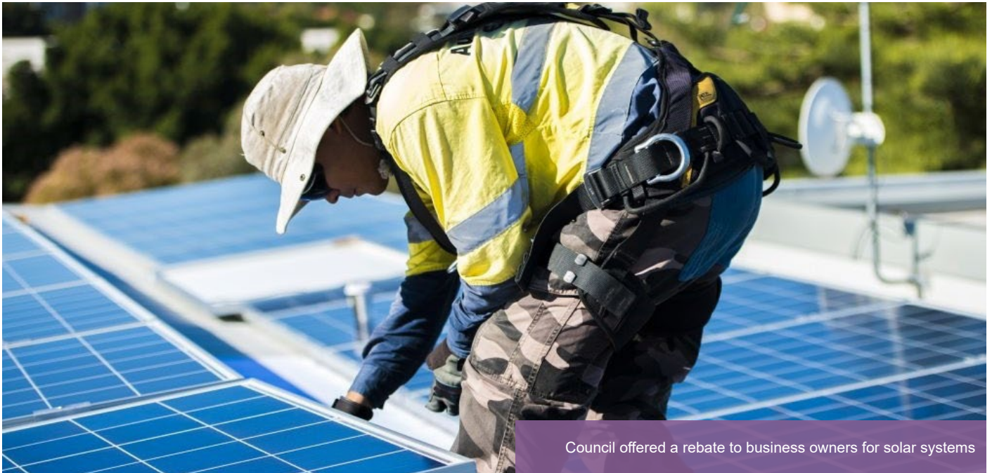
Council offered a rebate to business owners for solar systems

Creating economic employment opportunities through vital, attractive centres, business innovation and technology