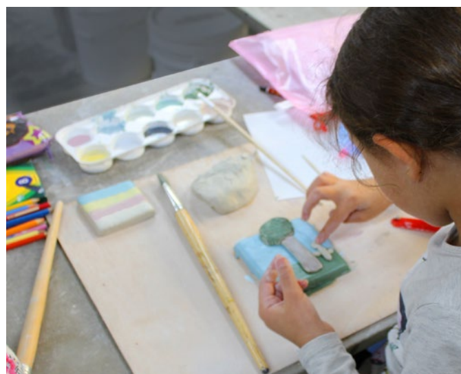
Art Centre children's class

During the January school holidays Ku-ring-gai Art Centre hosted a COVID-safe program of activities and classes for school-aged children, including pottery workshops, printmaking, jewellery making, sewing, drama, writing, and gardening.