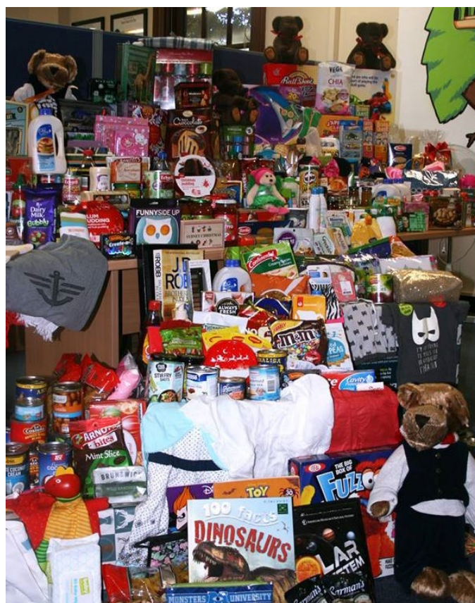
Mayoral Christmas Appeal on behalf of Lifeline

Apart from Australia Day, face to face citizenship ceremonies have been suspended until further notice. The Council's events team is continually reviewing its event program in the light of COVID-19 directives issued by the state and federal governments, with a view to scheduling other public events by the end of year.