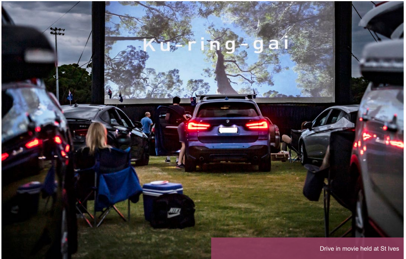
Drive in movie held at St Ives