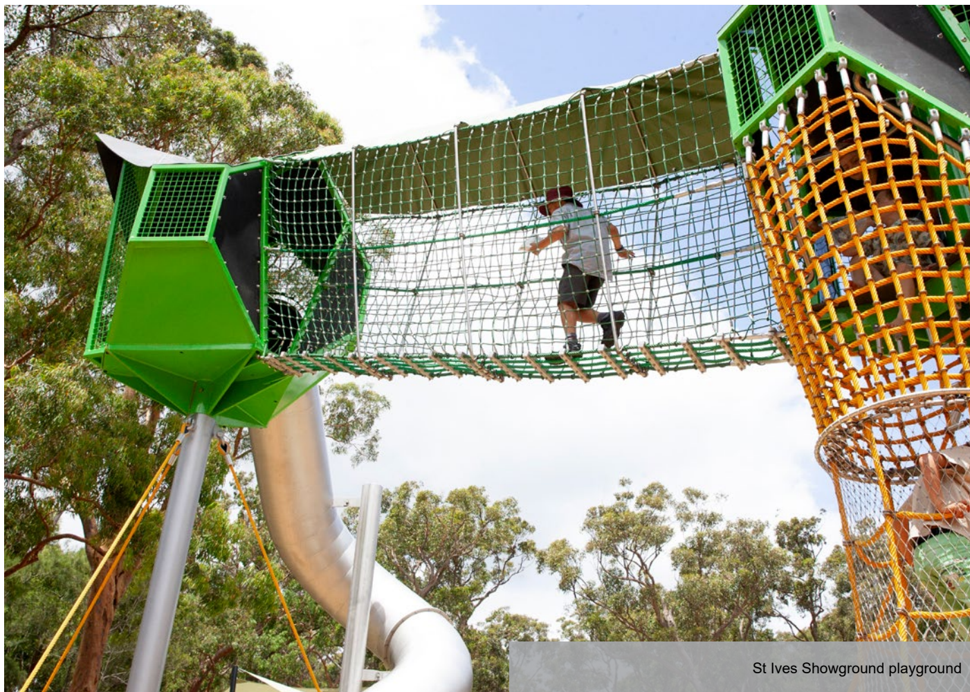
St Ives Showground playground