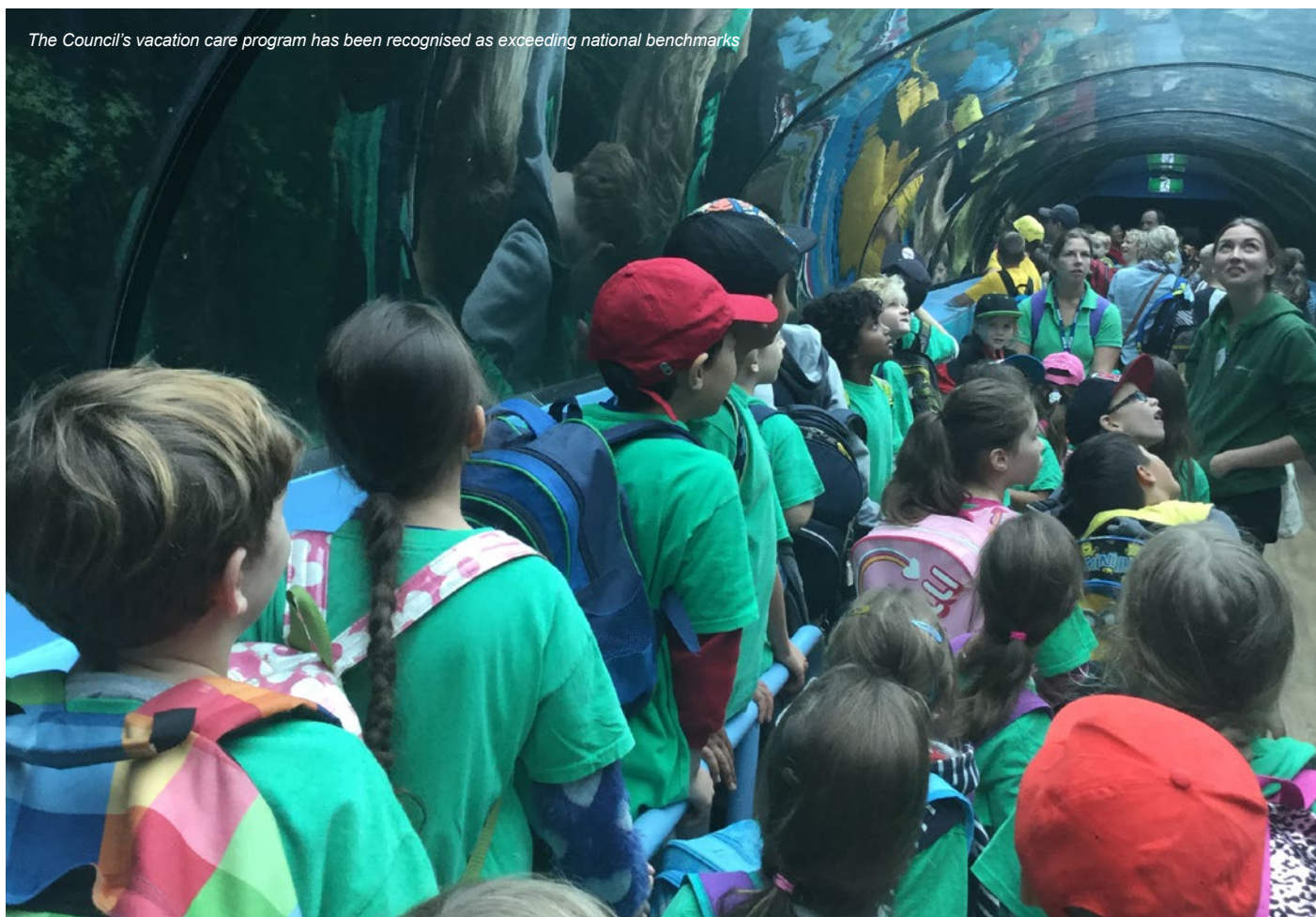
The Council's vacation care program has been recognised as exceeding national benchmarks