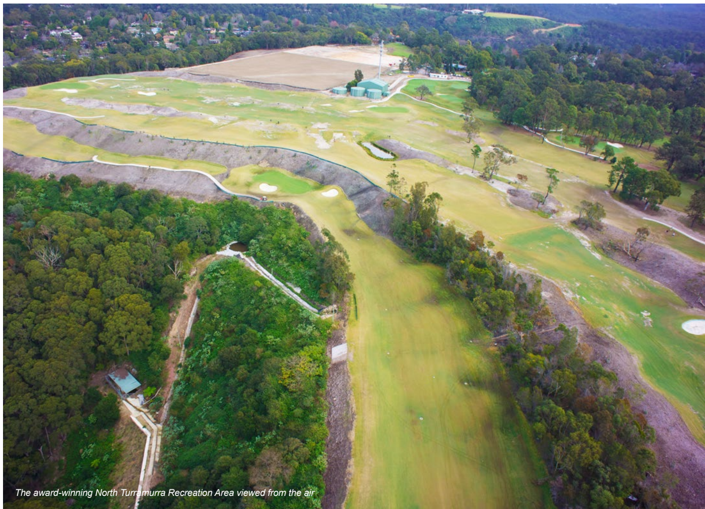
The award-winning North Turramurra Recreation Area viewed from the air