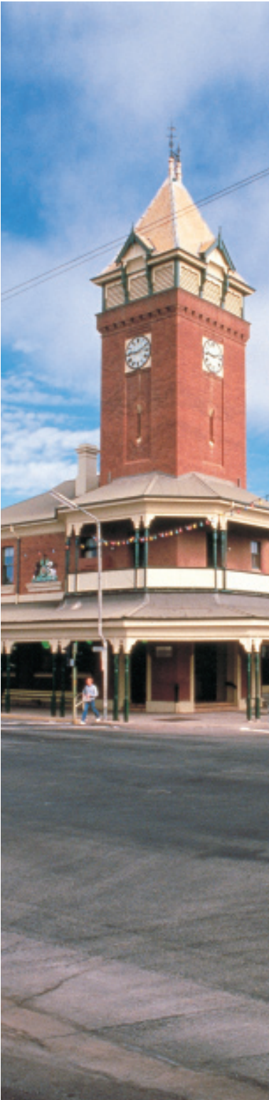
Administrator - Broken Hill City Council