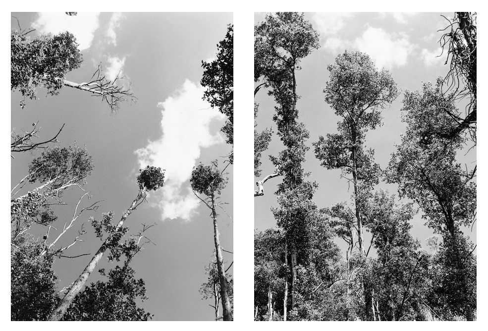
Figure 3. Left: damaged Turpentine canopy in 1985, Ku-ring-gai Flying-fox Reserve, Gordon. Right: recovering Turpentine canopy in 1995, same location.