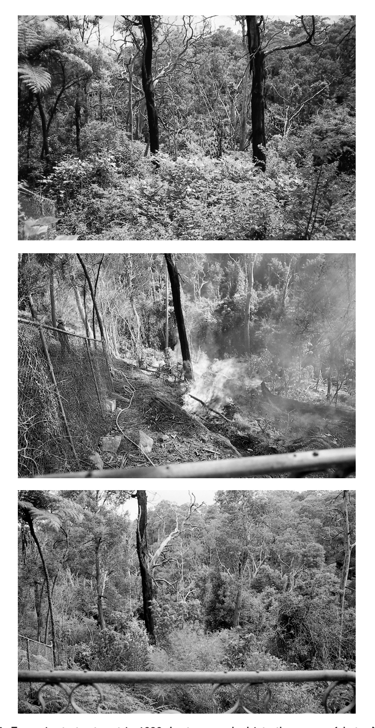
Figure 4. Top: prior to treatment in 1986, Lantana reached into the canopy (photo: N. Pallin). Middle: same view during phase 2 (1993) shortly after weed removal and during the burning of fire piles [note, second tree has fallen; (photo: M. Schofield)]. Bottom: native understorey regeneration in 1997, 4 years after treatment (photo: N. Pallin).

Williams, unpubl. data, 1989). With the change in the vegetation during the primary stage of bush regeneration, there was a danger that feral birds, such as the Common Mynah ( Acridotheres tristis ) might invade. Fortunately, this has not occurred.