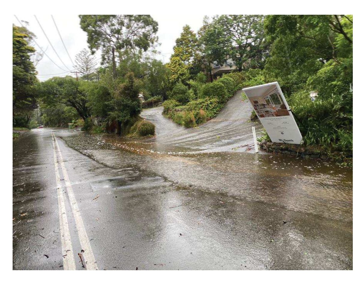
Figure D.2 Ponding on street in Roseville Chase during February 2020 storm