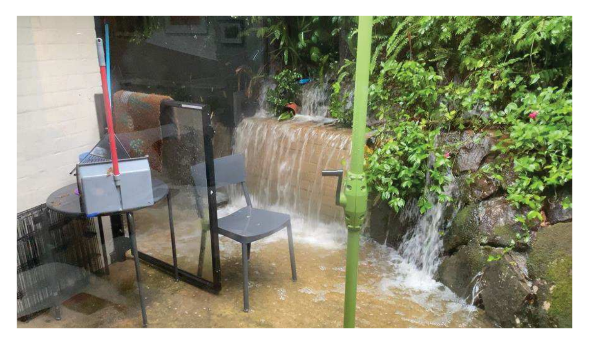
Figure D.3 Runoff into property in Roseville Chase during February 2020 storm