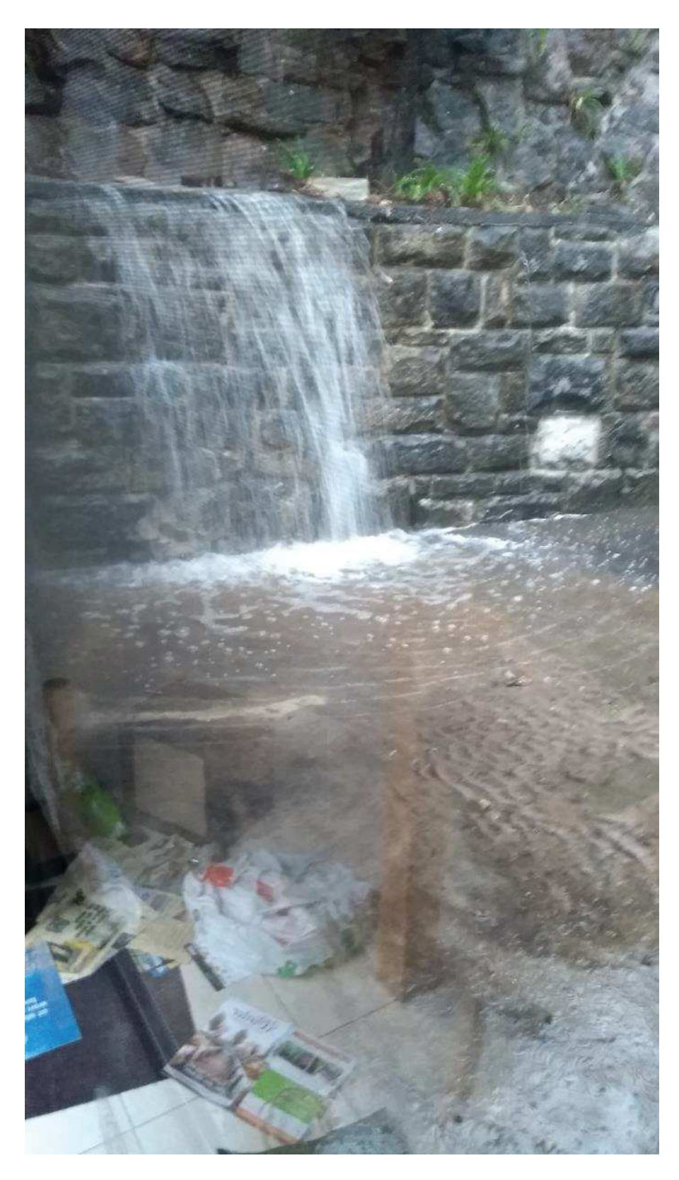
Figure D.4 Runoff into property in Roseville during February 2020 storm