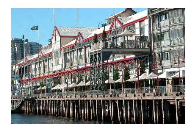
Listing keeps heritage places authentic, alive and useful.