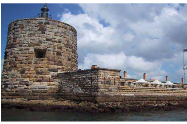
Listing will not stop all change or freeze a place in time.