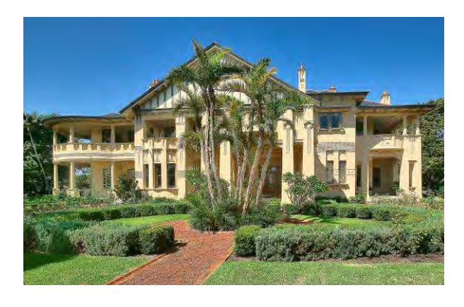
Listing gives owners improved access to heritage grants.