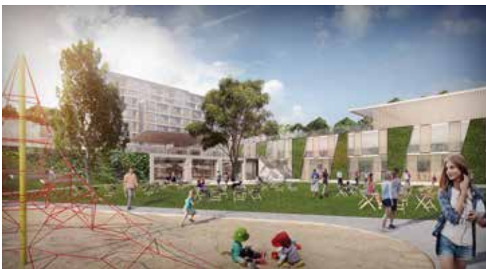
Illustrative view of proposed park