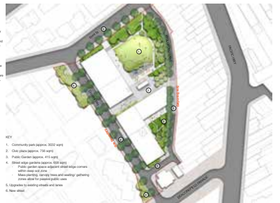
Illustrative master plan