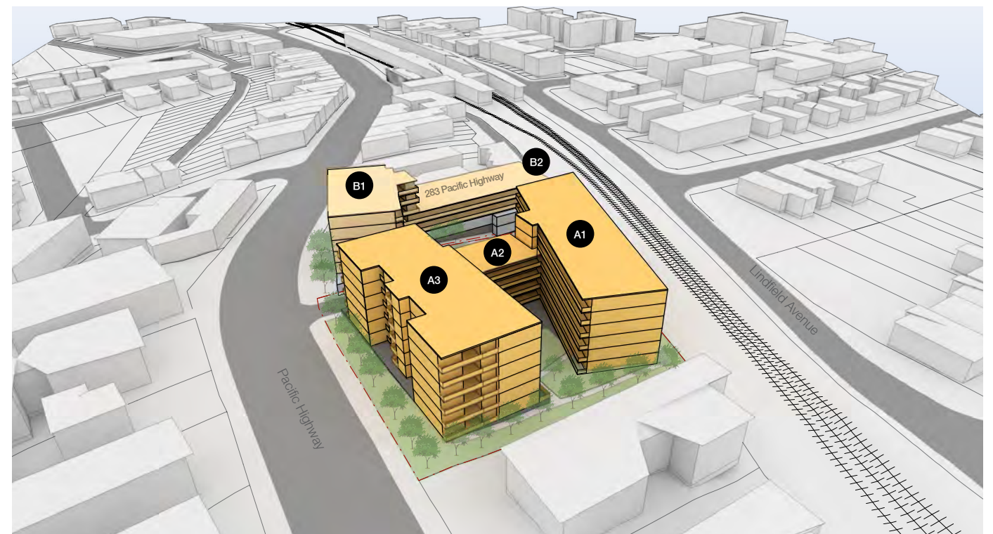
View from the South West