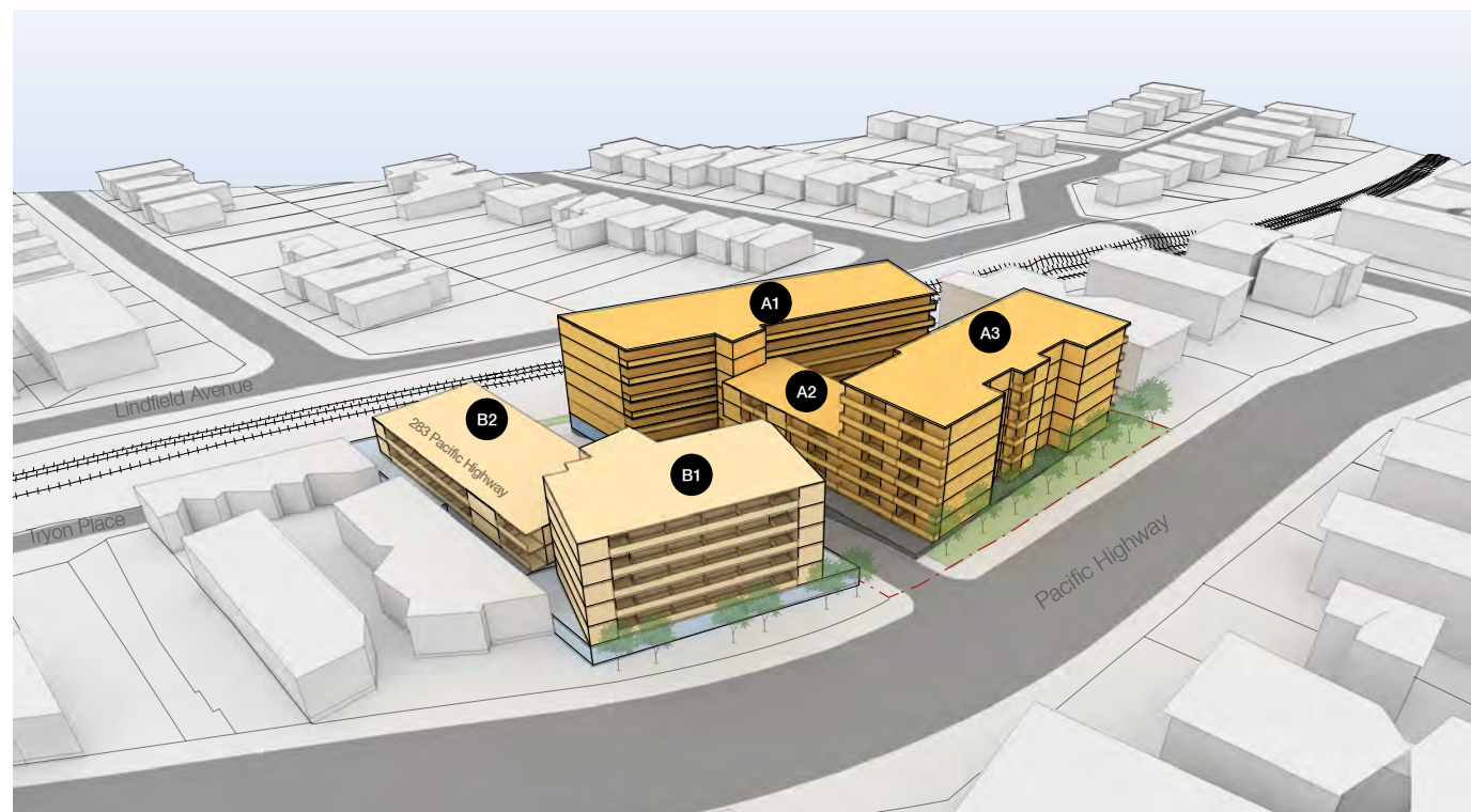
View from the North West