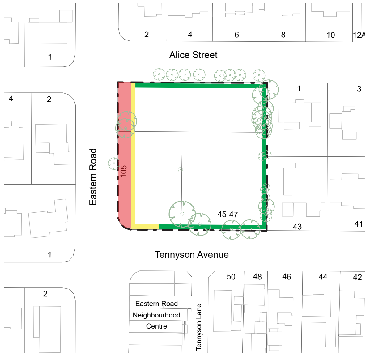
Figure 14K.4-1: Built Form Plan