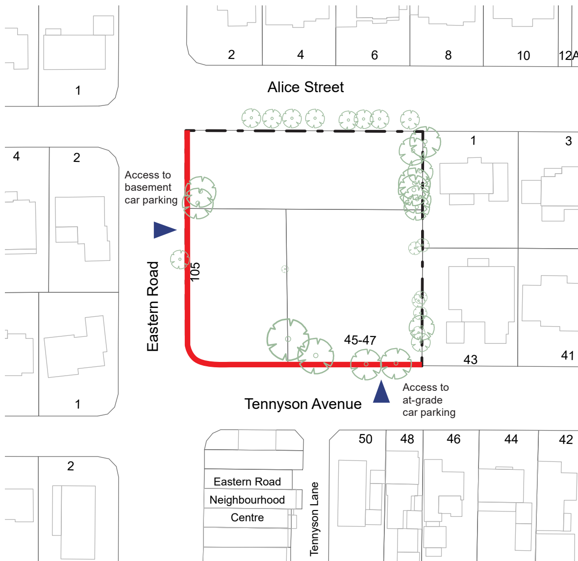
Figure 14K.2-1: Pedestrian and Vehicular Access Plan