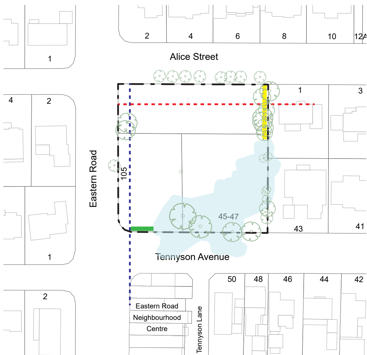
Figure 14K.3-1: Building Setbacks Plan