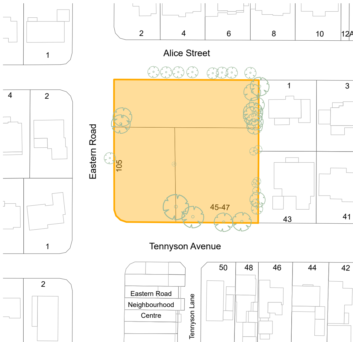
Figure 14K.1-1: Planned Future Character Plan