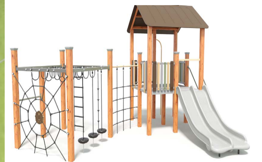
(C) Multi-functional play unit with slide