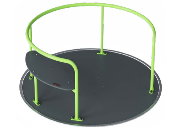
(B) Accessible carousel