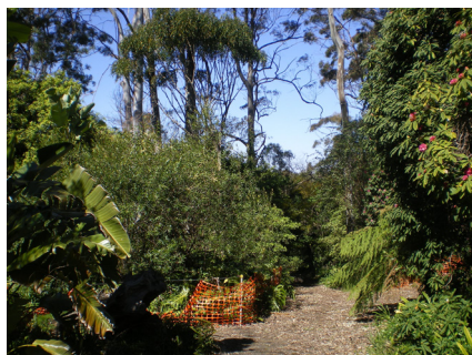
Figure 18.3-1: Examples of Support for Core Biodiversity Lands