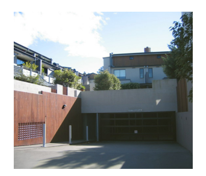
Figure 22.3-1: Secure basement car parking.