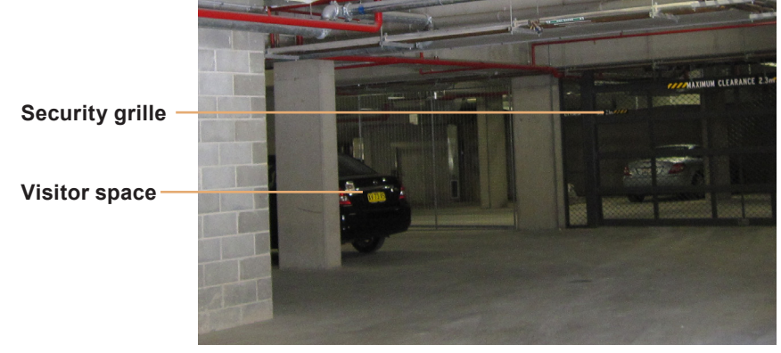
Figure 22.4-1: Basement visitor parking provided in front of security grille.