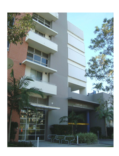
Figure 22.2-2: Vehicle entries that are well integrated with overall facade design.