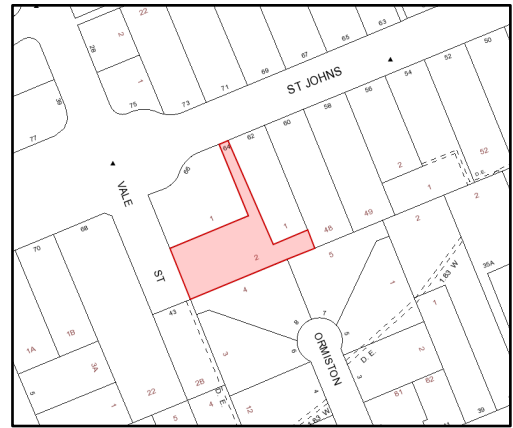
64 St Johns Avenue, Gordon